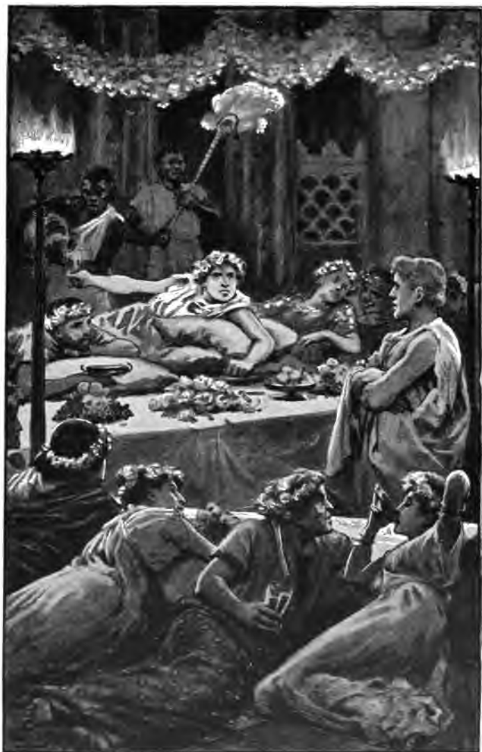
BERIC CONFRONTS NERO AT THE BANQUET